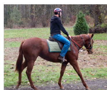
Sunpenny is a Washington-bred by the Kentucky based stallion Good Reward .

The filly's dam, Cascade Corona by Pine Bluff , was the winner of the Boeing and King County Handicaps in 2004 at Emerald Downs at age 4.