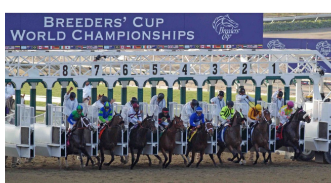
Ladies Classic Start