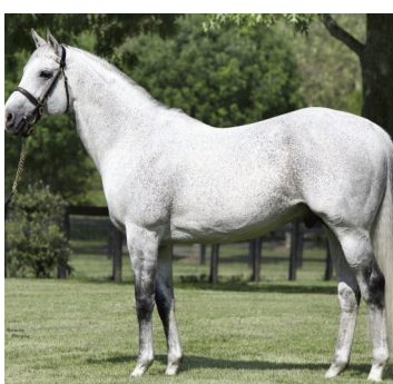
Mizzen Mast is a 14 year-old, 16.1 1/2 hands stallion standing at Juddmonte Farm in Lexington, Kentucky

Flotilla (FR) and Mizdirection win the F&M Juvenile Turf and Turf Sprint