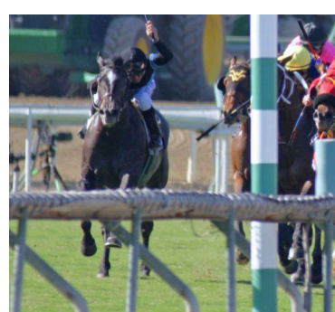
Mizdirection's scintillating stretch drive wins the BC Turf Sprint against the boys.

The ZTR colt's 2nd dam sire is Nureyev , himself the sire of 3