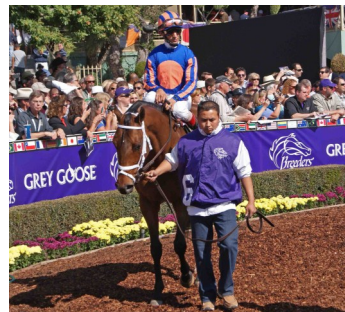
Turbulent Descent with John Velasquez up in the paddock for the F&M Sprint

The 2 year-old races determined who is the front runner for the 2013 Kentucky Derby when Starlight Racing and Coolmore's Shanghai Bobby made it a perfect 5 for 5 and won the BC Juvenile over Reddam Racing's He's Had Enough . The Juvenile Fillies was won by Spendthrift Farm's Beholder , by Henny Hughes, off of an 11 length Allowance win and who was 2nd by a nose to Executiveprivilege in the Del Mar Debutante in July.