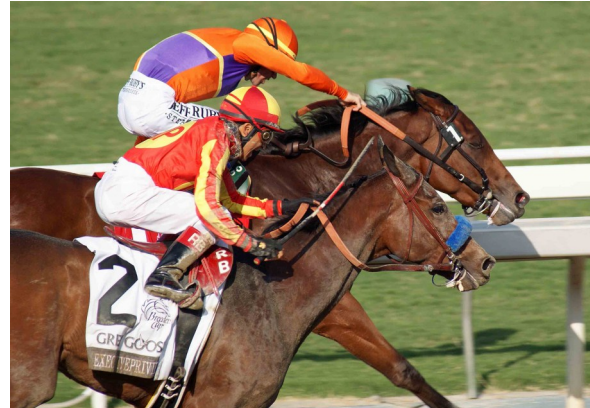
Beholder on Rail Beating Executiveprivilege