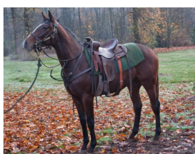
This Mizzen Mast colt will be offered for partnerships by Z Thoroughbred Racing LLC in 2013.