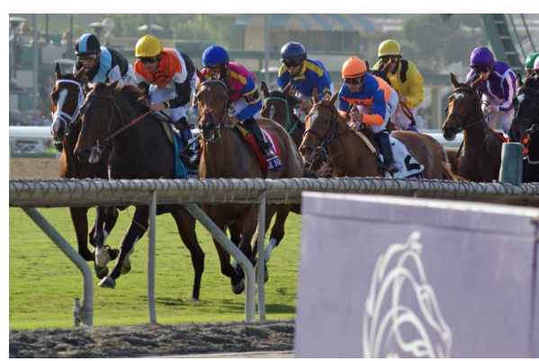
Stormy Lucy, Blue Silks, in the F&M Turf