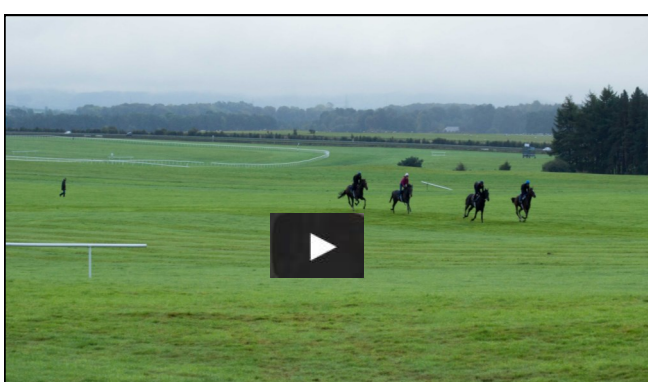
Curragh Training Grounds supports 1000 horses with 60 trainers utilizing 1500 acres and 70 miles of grass gallops.