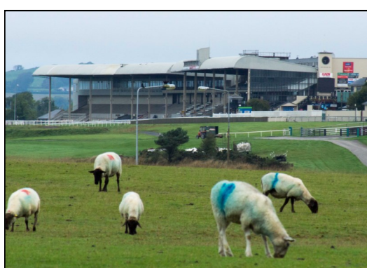
The Curragh Racecourse in Ireland has been running the Irish Derby since 1866 and the first recorded race on the Curragh plains was in 1727.

Z Thoroughbred Racing recently visited the largest horse training center in Ireland, the Curragh Training Grounds and observed first-hand the training methods of European trainers utilizing the natural grass plains of Ireland.