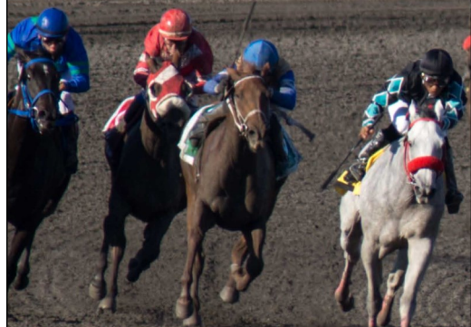
Sunpenny is Z Thoroughbred Racing's 2 yr-old filly shown making her move off the turn in the Northwest Farms Stakes at Emerald Downs on September 8th.

Z Thoroughbred Racing's 2 year-old filly Sunpenny finished 2nd in the $50,000 Northwest Farms Stakes rallying from 7th to beat 7 other rivals earning catalog-page black type as a stakes placed filly.