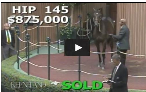
El Mesano's half-brother sells at Keeneland September 2013 to Shadwell Estate Company and Sheik Hamden of Dubai. http://youtu.be/861AnX9uGyg

Colt's Last Timed Workout at Pegasus Training Center was Sept. 27th - Now at Golden Gate Fields