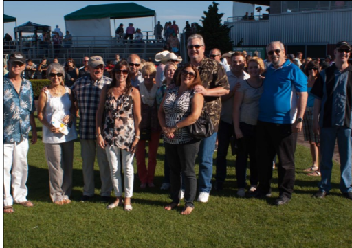
Sunpenny partners in the Emerald Downs paddock before the race.

Sunpenny has earned a $27,890 with a 1-3-0 record from 4 starts. She also will receive a WA-bred bonus from the state in December in the state of Washington sponsored