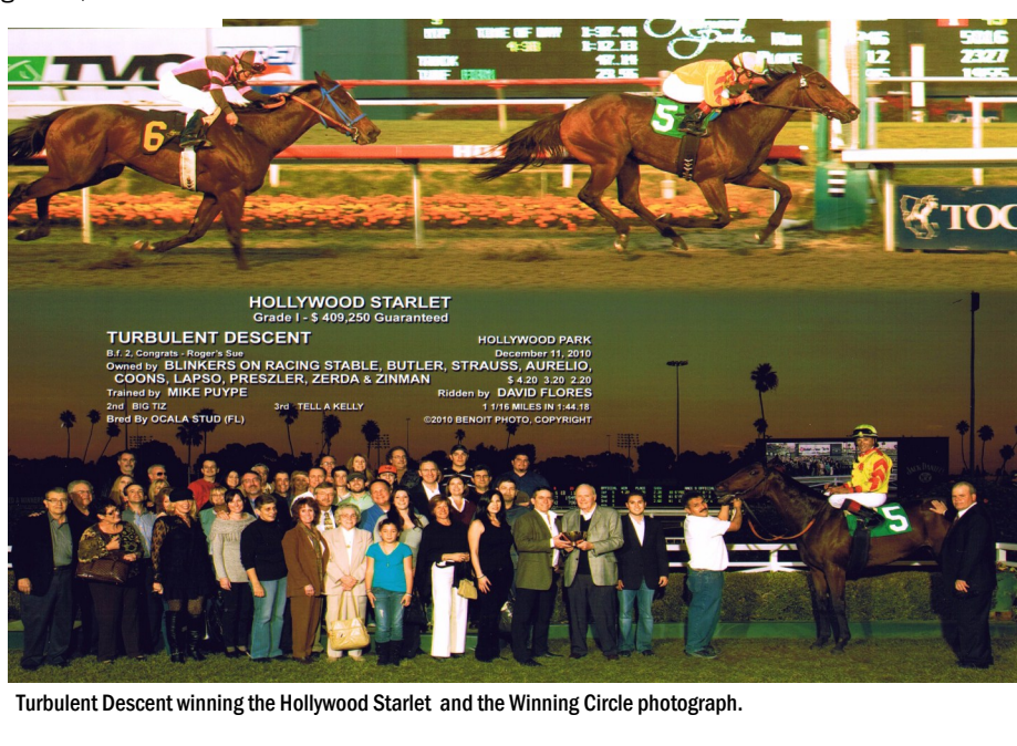
Turbulent Descent winning the Hollywood Starlet and the Winning Circle photograph.

As owner you will receive winning circle photographs to commemorate all winning rides!