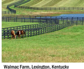
Walmac Farm, Lexington, Kentucky