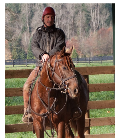
Harbor the Gold's offspring won 13 Stakes Races in 2010

in 2010 were Stakes Winners. Harbor the Gold ranks tied for 8th overall in progeny Stakes Winners and 5th overall in Stakes Wins for North America's 3rd Crop sires with only 40 total runners.