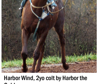
Harbor Wind, 2yo colt by Harbor the Gold

The stallion leads all West Coast studs in producing Stakes Winners with 6 and Stakes Wins with 13. A stunning fifteen percent (15%) of Harbor the Gold's runners