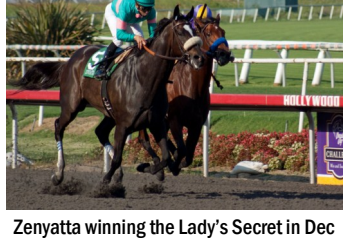
Zenyatta winning the Lady's Secret in Dec 2010.

Z Thoroughbred Racing LLC is a limited liability corporation offering partnerships in similar format. Partnerships are sold