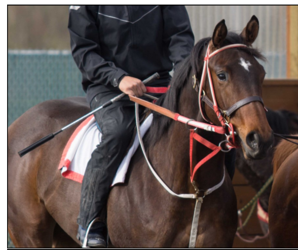
Lauren's Bluff is an unraced 2 year-old WA-bred filly available now for partnership shares. Nominated for the NW Race Series at EmD - the $50K Angie C. and $50K Barbara Shinpoch Stakes.

Lauren's Bluff is inbred to the great Danzig (3S x