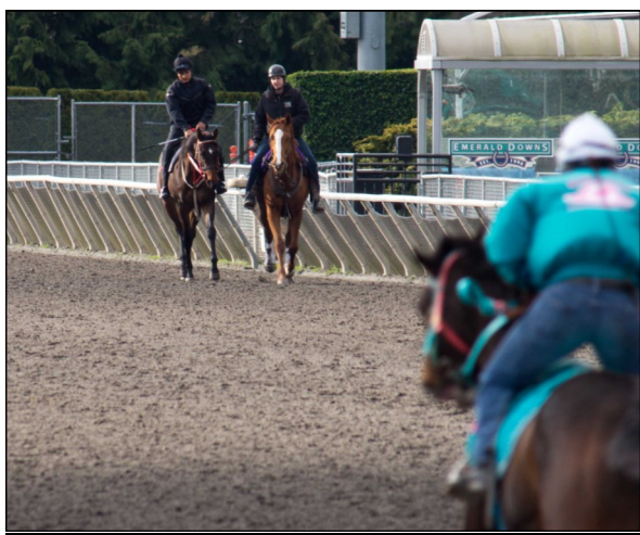
Lauren's Bluff by Raise the Bluff, jogs with a pony at Emerald Downs preparing for her 2014 campaign. Her dam's half-sister Royal Lahaina is a Graded Stakes winner of $537,000.