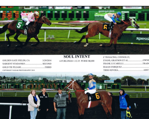
Soul Intent won on the Tapeta track at 6 furlongs at Golden Gate Fields. He has been shipped to Emerald Downs to compete this