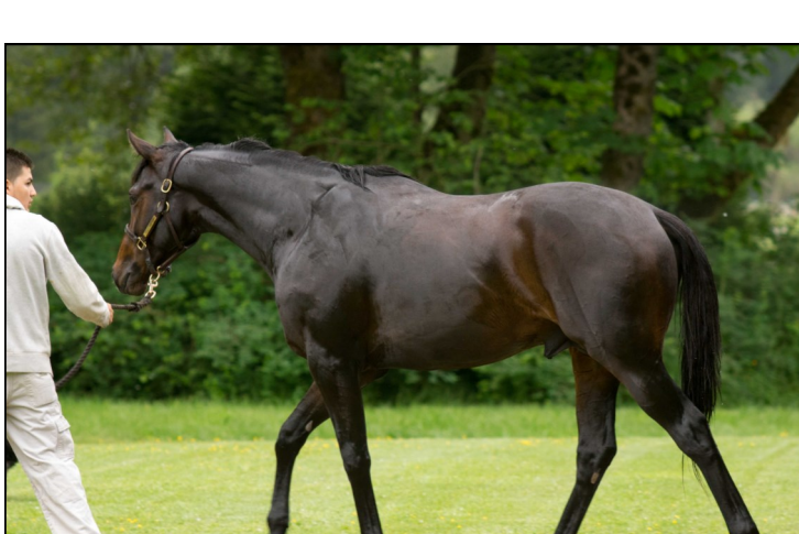
My Discretion shown after his bath, has been training at Jones Farm since April 23rd. He will be moved to Emerald Downs under a to-be-named trainer in the next few weeks.