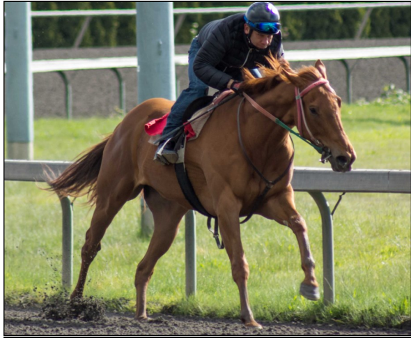
Sunpenny , is owned by a ZTR partnership group initiated in 2013 when Sunpenny was 2 years old. She raced 4 times in 2013 and made her 2014 debut last month at Emerald Downs.

Likely Foes are WA 2yo filly Champion Chu and You and CA Stakes Winner City by the Bay