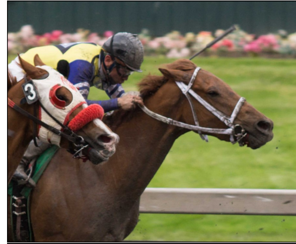
Sunpenny was sired by the KY based stallion Good Reward, a full bro to Pure Prize, and bred by Blue Ribbon Farms in Buckley, WA. She is out of a multiple stakes winner Cascade Corona by Pine