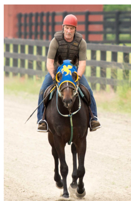
My Discretion is a 2yo FL-bred colt by a KY based stallion and G1 winner Discreetly Mine . His grandsire Mineshaft is a sire of 26 stakes winners and other G1 winners, It's Tricky , Dialed In , and Bond Holder .

2 year-old Florida-bred colt My Discretion , who has begun race training for Z Thoroughbred Racing, has a sprinter's body with good balance, a strong hip, smooth walk, and long stride.