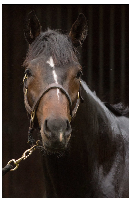
My Discretion is by first-crop sire Discreetly Mine and is a grandson of Champion Mineshaft by AP Indy and is a half-brother to both Pretty Wild and G1 Cigar Mile winner and red-hot stallion Discreet Cat .