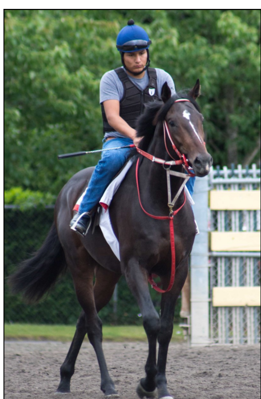
My Discretion is by first-crop sire Discreetly Mine and is a grandson of Champion Mineshaft by AP Indy . Discreetly Mine is a half-sibling to both Pretty Wild and and red-hot stallion Discreet Cat .