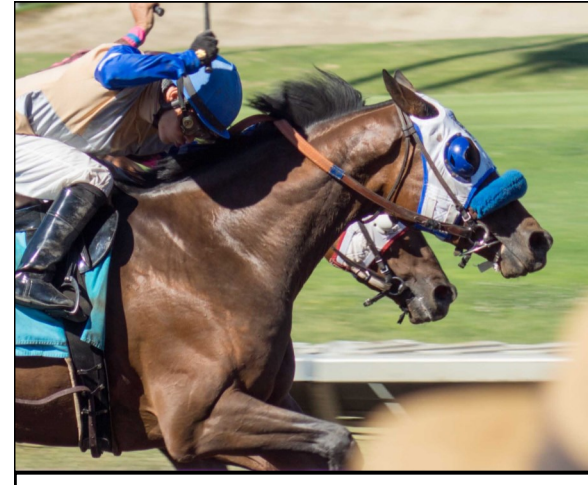
El Mesano , shown passing his last rival in the stretch in his maiden win, is trained by Hall-of-Fame trainer Jerry Hollendorfer and is based at Golden Gate Fields in Berkeley, California.

El Mesano's trainer Jerry Hollendorfer says that the gelding