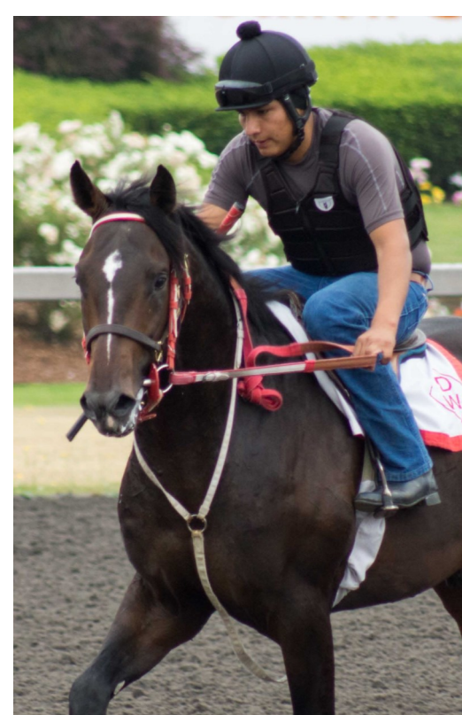
My Discretion is a 2 yo FL-bred colt by a KY based stallion and G1 winner Discreetly Mine . His grandsire Mineshaft is a sire of 26 stakes winners and other G1 winners, It's Tricky , Dialed In , and Bond Holder .

My Discretion's Offering Page Partnerships Forming Now!