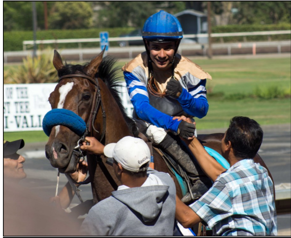
El Mesano , is owned by a ZTR partnership group initiated in 2013 when he was 2 years old. He has a record of 1-1-1 in 6 starts and earnings of $26,340 all in Allowance company.