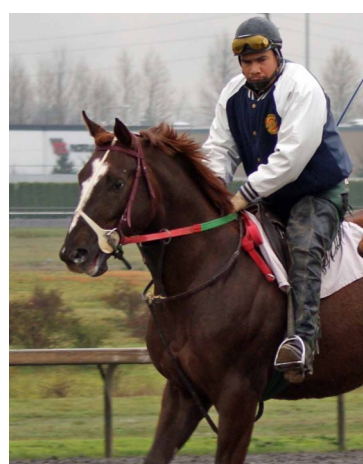
Harbor Wind, juvenile colt offered for partnerships by Z Thoroughbred Racing LLC, is sired by Harbor the Gold.

Harbor the Gold ranks tied for 8th overall in progeny Stakes Winners and 5th overall in Stakes Wins for North America's 2010 3rd Crop sires with only 40 total runners.