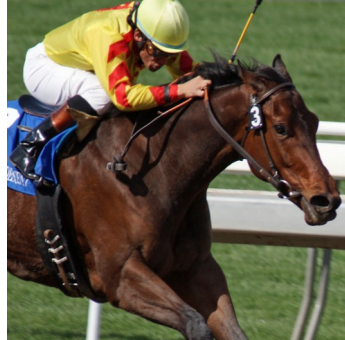
Turbulent Descent winning the Santa Anita Oaks on March 5th, 2011.