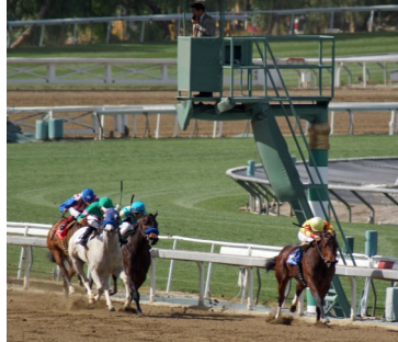
Turbulent Descent leading in upper stretch in the Santa Anita Oaks.