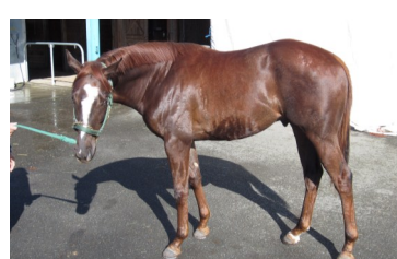
Harbor Wind at Emerald Downs