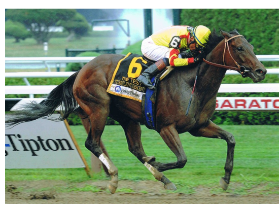
Turbulent Descent Wins Test Stakes in New York on Saturday afternoon, below.