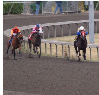
Harbor Wind, 2yo colt by Harbor the Gold, is shown winning his maiden race at Emerald Downs in August.

ers to the colt to keep him focused on business especially around the turn.