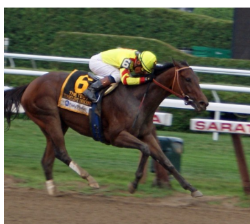
Turbulent Descent winning the 76th running of the Grade 1 Test Stakes for 3 year-old fillies at Saratoga recording a 103 Beyer.