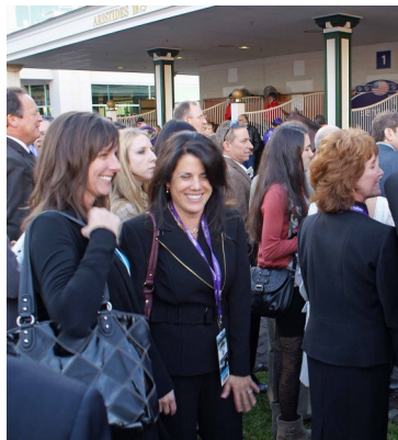
Turbulent Descent's partners in the paddock at the Breeder's Cup World Championships. TD is pointing toward the La Brea at Santa Anita on December 31st.

Turbulent Descent, a troubled 5th in the Breeder's Cup World Championships on November 4th at Churchill Downs, is planning to run in the $300,000 La Brea (G1) for 3 year-old fillies at Santa Anita on New Year's Eve.