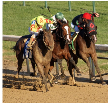
Turbulent Descent shown taking the lead in upper stretch in the Breeder's Cup Filly & Mare Sprint (G1).