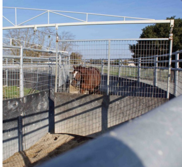
Harbor Wind in the horse exerciser at Sunny Creek Farm in December.

Harbor Wind, 2 year-old gelding owned by Z Thoroughbred Racing Partners I, has commenced jogging in the exerciser at Sunny Creek Farm in Galt, California.