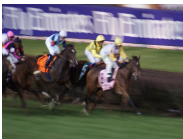
Perfect Shirl (No. 8) wins the $2M BC Filly and Mare Turf at 27-1.