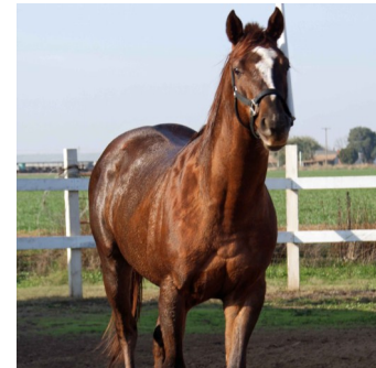
Harbor Wind will begin his 3 year-old campaign at Golden Gate Fields.